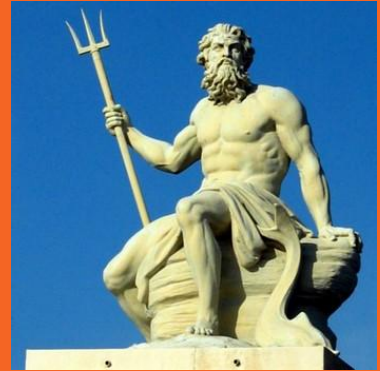
Poseidon: villain and vengeful troll