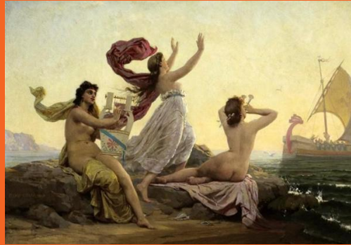
The Sirens: an otherworldly image-conscious girl group