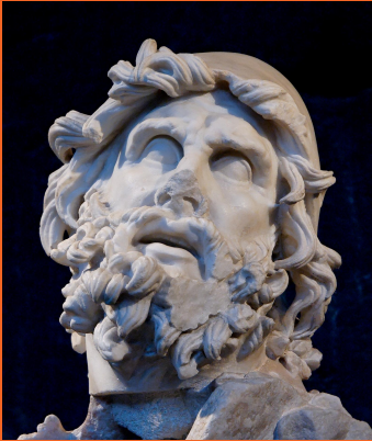
Odysseus: travel-blogging wandering hero

The Transmedia Odyssey will be told across three social media platforms, following the experiences of 3 of the most iconic characters from the Odyssey, each with their own storyline and interactions: